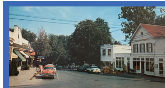
Woodstock looking down Mill Hill Road from the Green circa 1950's.

The Eames House: Originally one of the outbuildings of the Eames Estate, built in 1911. The structure was remodeled into an art studio some time prior to the early 1920's. The Town of Woodstock lent the building in 1982 to the HSW to house its collection. The Society leased it from the town in 2007.