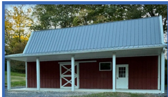
New Jean White Archival Building

The new building will better enable the HSW to preserve and protect its collection of Woodstock's history for future generations.