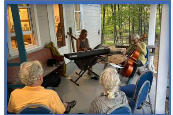
Wine Tasting Event