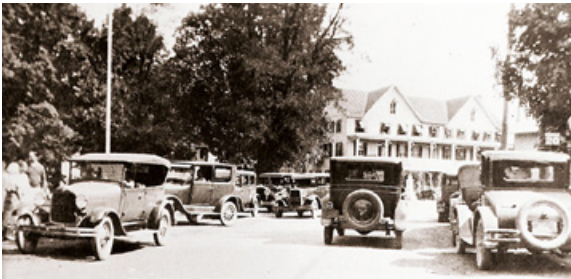
Tinker Street 1920's