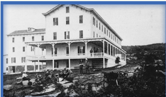
View of Meads Mountain House - circa 1880s

The HSW welcomes and encourages the donation of appropriate materials related to Woodstock. Please contact the HSW if you are interested in donating.