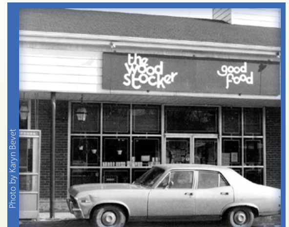
Woodstock Curator talk