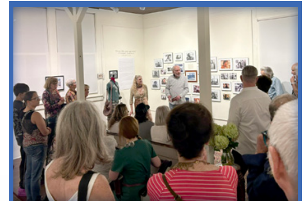
Exhibit Opening - "It Was Fifty Years Ago Today - 1970s Woodstock"